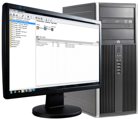
iJetColor Navigator Workflow User Interface

The integrated spot color matching application allows color correction that best matches PMS or existing printed colors on the stock that is being prepared for print on the iJetColor Label Press.